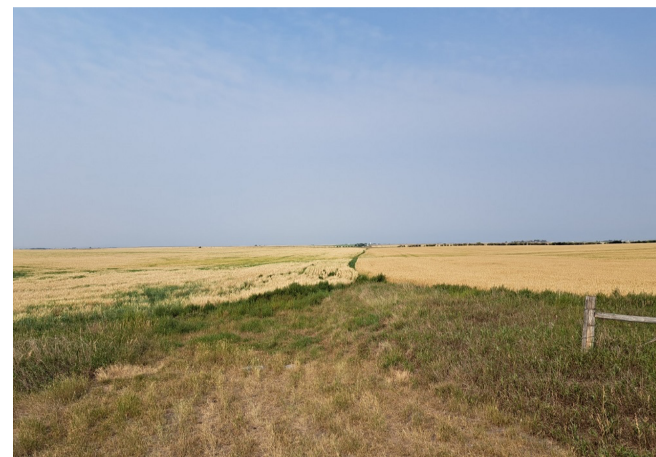
A right-of-way that has disappeared.

He says, "It's way easier to farm it, and make a few bucks, until you don't have any anymore."