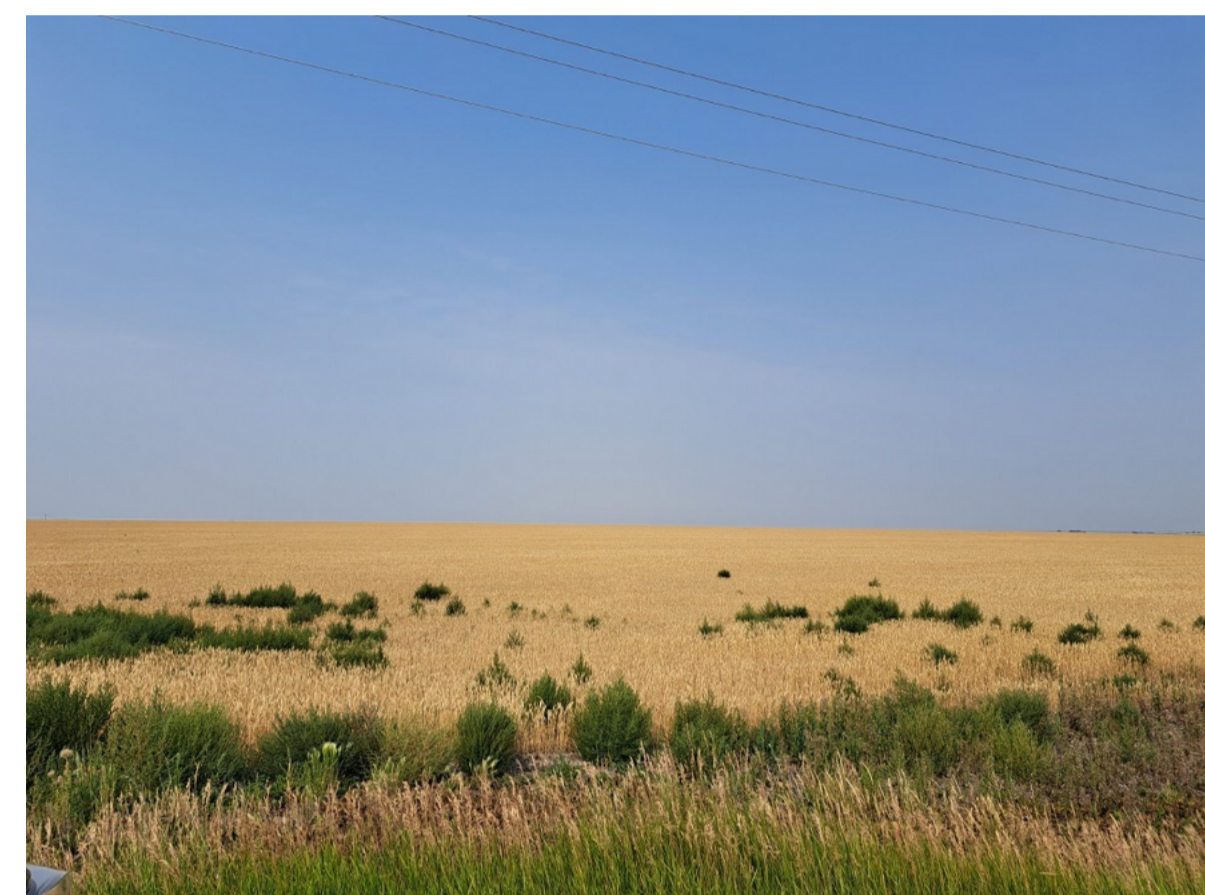
A road right-of-way that disappeared.

McCormick says the fact that farmers are willing to use the land for farming takes the maintenance off their plates, but he'd like them to take a bigger role in making sure they're still being preserved.